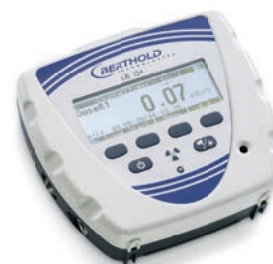
Figure 1: LB 134 UMo II base unit. Its software offers numerous measuring modes and parameter settings