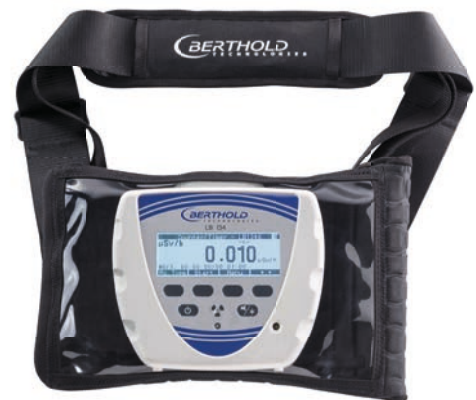
Figure 9: A practical bag with carrying strap is available for the LB 134.