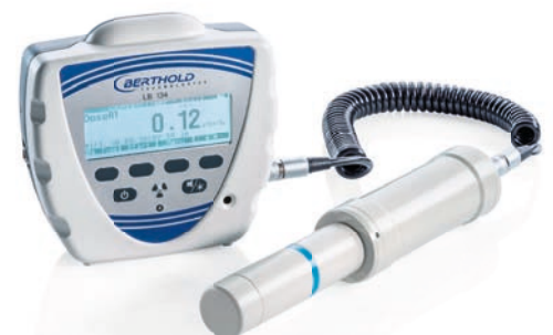
Figure 3: Portable combination of the LB 134 UMo II with the LB 1236-H10 gamma probe.