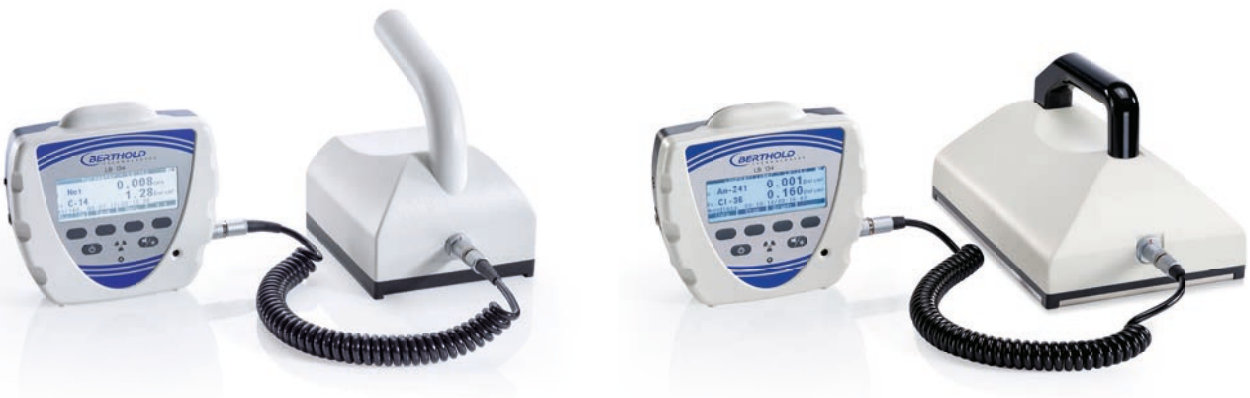
Figure 7: Two different scintillator probes are available: LB 1342 with 170 cm 2 area (left) and LB 1343 with 345 cm 2 area (right).