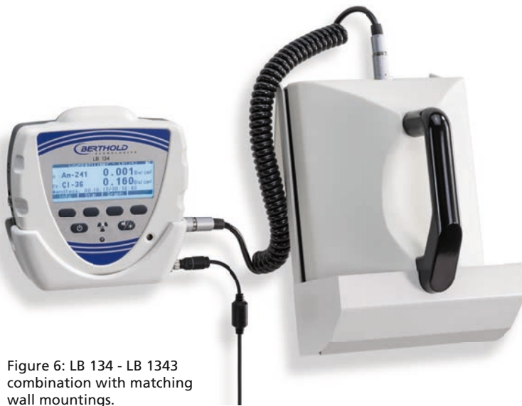
Figure 6: LB 134 - LB 1343 combination with matching wall mountings.

Explore our LB 134 measurement solutions