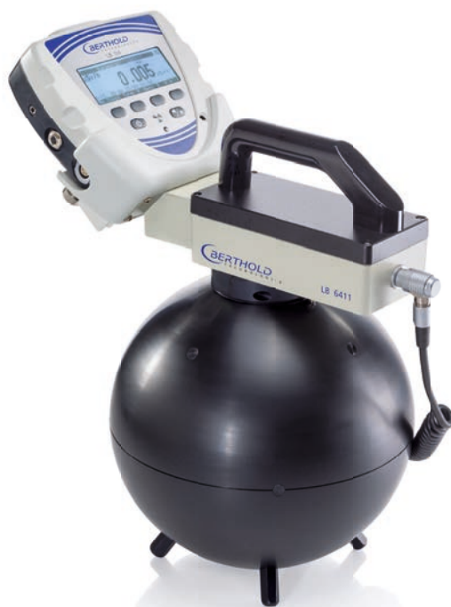
Figure 2: Mobile measurement setup of LB 134 UMo II connected to LB 6411 Neutron Dose Rate Probe.