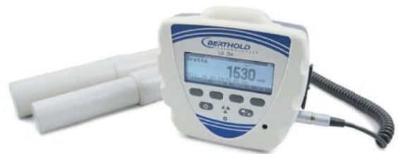
Figure 5: In combination with the LB 1234, the UMo II LB 134 offers a powerful mobile system for detecting radioactive gamma sources.