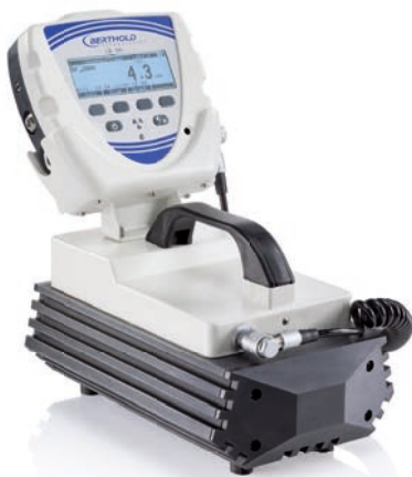
Figure 4: The LB 134 can be used as a portable neutron survey meter in combination with the LB 6414.